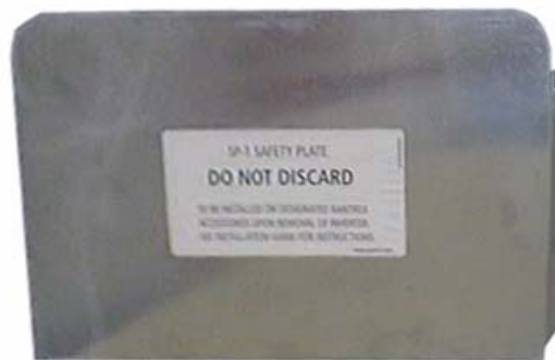
Figure 1-1 Safety Plate SP-1

The purpose of the Safety Plate (SP-1) is to prevent accidental contact with any live circuits or wires within either the DC Conduit Box (DCCB) or the AC Conduit Box (ACCB). The Safety Plate (SP-1) covers the open end of either the DCCB or the ACCB on the inverter side. It attaches to the base of the conduit box and is secured by the Sems screws that attach the top cover. The Sems screws have lockwashers attached and are used on the top and bottom of the top covers. The Safety Plate only needs to be installed in the event that the Sine Wave Plus inverter is removed from the system.